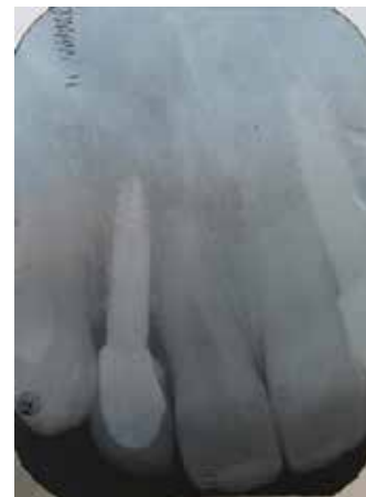
Figure 4. Radiographic periapical view of right lateral implant (remained excess cement).