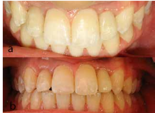
Figure 3. Delivered restorations after 1 months