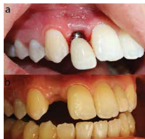
Figure 5. a) Crown and fixture removing together. b) After 4 days of explantation.