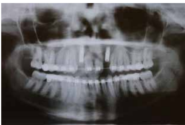
Figure 1. Post implant insertion panoramic view.

After four months, the patient returned with complaining of mobility of right lateral implant restoration. On examination, the crown was not uncemented. The gingiva was pink, with normal texture and there was no pain, exudate and swelling. The mobility was in horizontal direction, neither vertical nor rotational direction. The radiographic evaluation showed normal levels of bone with no pathology, but a little cement was remained in mesial margin of the crown (Fig 4). The most probable cause was seemed to be abutment screw loosening. Therefore, we decided to remove the crown and retighten the abutment screw. While trying to remove the crown, suddenly crown and fixture removed together with little bleeding. Unfortunately, the implant was failed and explantation was done (Fig 5).