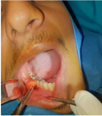
Fig. 6. Removing the lesion from its site.