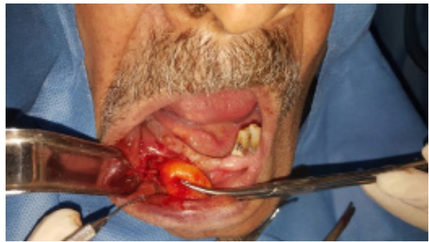
Fig. 2. Right mental nerve is seen in the lesion.