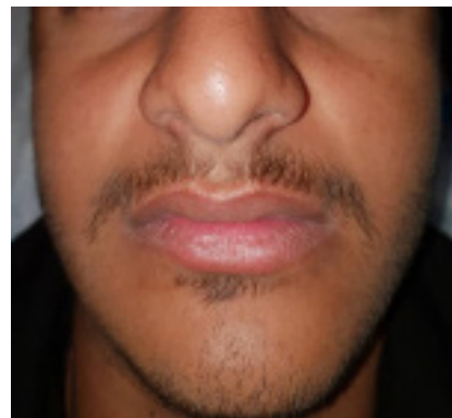
Fig. 4. Painless swelling in the right mandible.