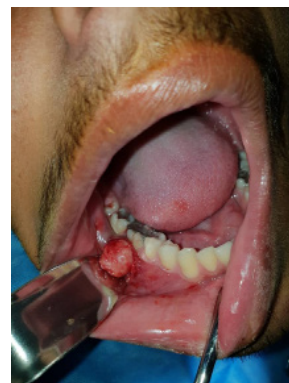
Fig. 5. Intraoral view of the exposed lesion.