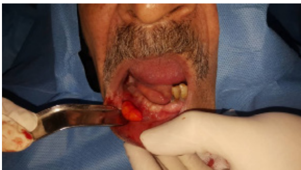
Fig. 1. Intraoral view of oral lipoma after performing horizontal incision.

An 18-year-old man referred to a maxillofacial department. His chief complaint was painless swelling in the buccal mucosa for about eight months. The lesion was about 1.5cm and mainly soft on palpation (Fig. 4). Excisional biopsy was done under local anesthesia. The incision was about 2cm (Fig. 5). The lesion was capsulated and completely dissected (Fig. 6 and 7). The laboratory examination revealed an adipose tissue and a thin capsule surrounding the lesion and pathologic diagnosis showed an intraoral fibrolipoma. There were no complications during and after the surgery and no sign of recurrence after twelve months.