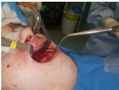
Fig 4. Apply a new bone hook.