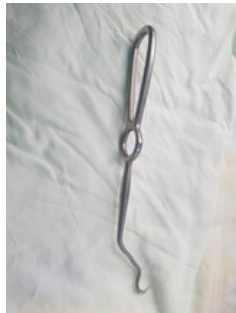
Fig 3. New design of bone hook.