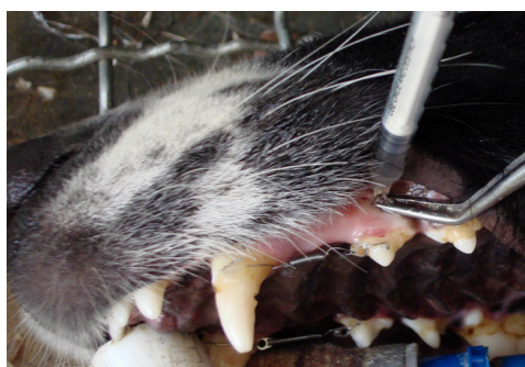
Fig 1. Injection in maxillary arch with orthodontic appliance.

of root resorption. This calculation was done by using Nilu software (Nilu pathology image analyzer, Iran). This procedure was done by a pathologist and the measures were repeated twice with the interval of 4 weeks. All the processes in present study including radiography were done under general anesthesia and intubation. Anesthesia was initiated by intramuscular injection of ketamine hydrochloride (20mg/kg Rumpun, Bayer, Seul, Korea) and acepromazine (0.02mg/kg At-ravet, Ayerst, Monteval, Quebec) and it was then continued by using 2-3% Halothane gas (Halothane BP, Cambridge, Ontario, Canada) until anesthesia symptoms appeared.