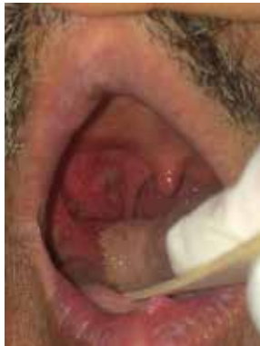
Figure 6. Squamous cell carcinoma of the soft palate.