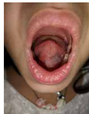
Figure 3. Squamous cell carcinoma of the floor of the mouth.