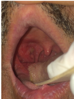
Figure 6. Squamous cell carcinoma of the soft palate.