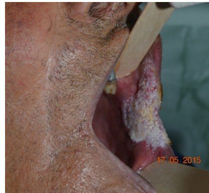
Figure 9. Leukoplakia verruciform type (Squamous cell carcinoma was proven by incisional biopsy).