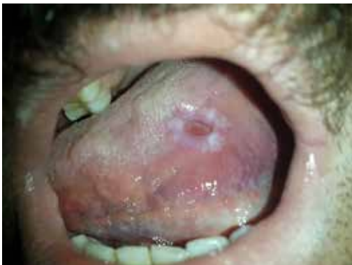
Figure 7. Ulceration of the lateral border of tongue.