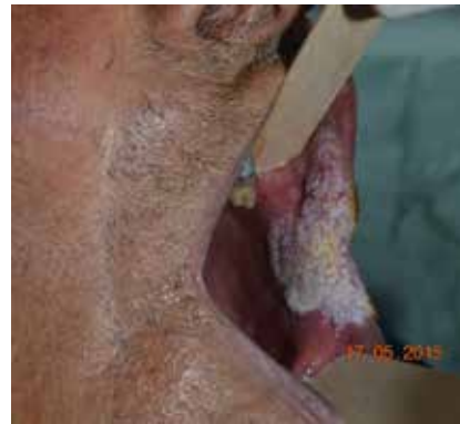
Figure 9. Leukoplakia verruciform type (Squamous cell carcinoma was proven by incisional biopsy).