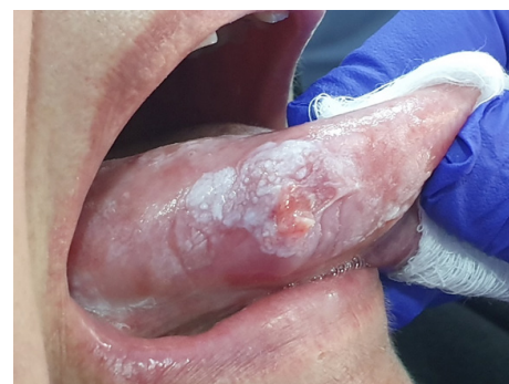
Figure 2. Squamous cell carcinoma of lateral border of the tongue.