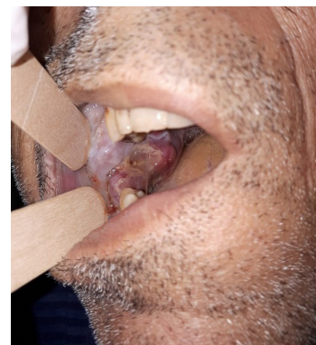
Figure 4. Squamous cell carcinoma of the lower alveolar ridge and buccal mucosa.