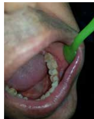
Figure 11. Erythroplakia of lower vestibule.