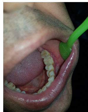
Figure 11. Erythroplakia of lower vestibule.