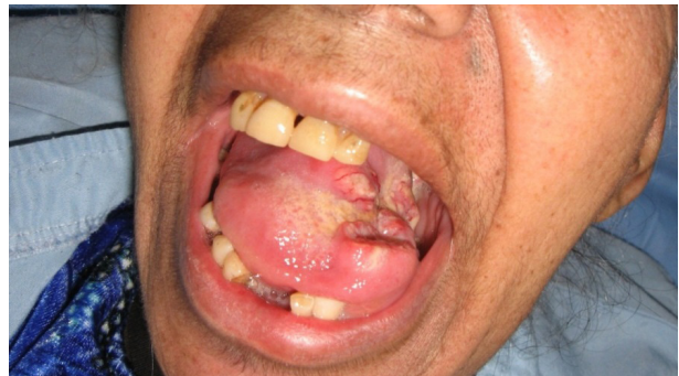
Figure 10. Ulcerated swelling and tongue fixation.