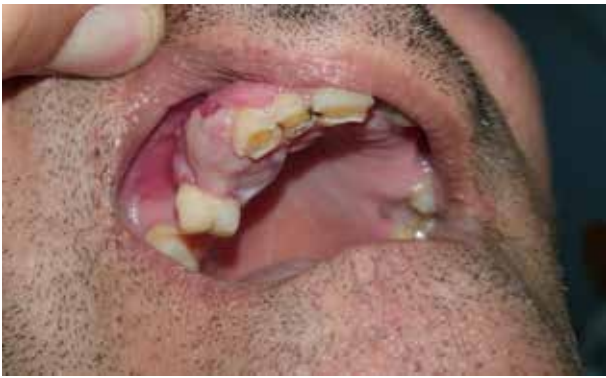
Figure 5. Squamous cell carcinoma of the upper alveolar ridge.