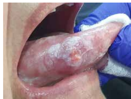
Figure 2. Squamous cell carcinoma of lateral border of the tongue.