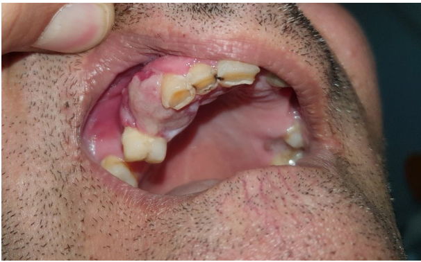
Figure 5. Squamous cell carcinoma of the upper alveolar ridge.