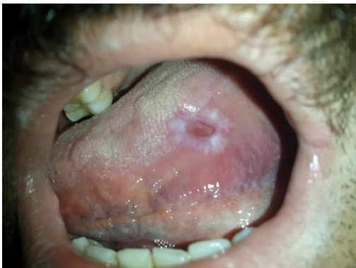
Figure 7. Ulceration of the lateral border of tongue.