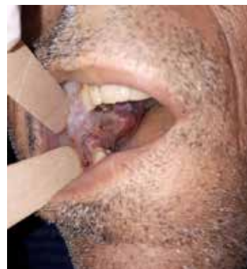
Figure 4. Squamous cell carcinoma of the lower alveolar ridge and buccal mucosa.