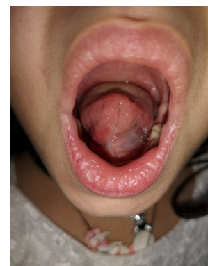
Figure 3. Squamous cell carcinoma of the floor of the mouth.