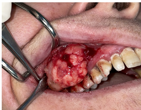
Figure 2. Operation view of the lesion.