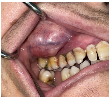
Figure 1. Preoperative intraoral view of the lesion.

swelling has been present for about 10-12 years, grows slowly and painless. The patient stated that she applied to our clinic because the swelling reached large dimensions and made it difficult to eat. She had systemic hypertension. No bone involvement or erosion was found on the patient's panoramic radiograph. In the oral examination, it was observed that the oral hygiene was quite poor. There was a rubbery and mobile swelling extending to the upper lip in the vestibule sulcus at the level of teeth 14 and 17 on the right side of the maxilla (Picture 1). No fluctuation or pulsation was detected in the lesion. Its temperature was normal. Differential diagnoses of lipoma or fibroma were prioritized due to the location of the swelling, its painless nature and consistency. The lesion was excised under local anesthesia, adhering to surgical principles. The lesion was approximately 5.7x4.5x3.2 in size (Picture 2). When the lesion, whose color is yellow-pink, was divided into two from the center, mucus-like areas were observed in places. The completely excised lesion was sent to Istanbul University Oncology Institute, Department of Tumor Pathology and Oncology Cytology for histopathological examination (Picture 3). Diagnosis of pleomorphic adenoma was made as a result of histopathological examination.