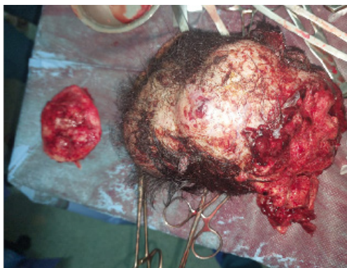
Figure 4. Removal part.