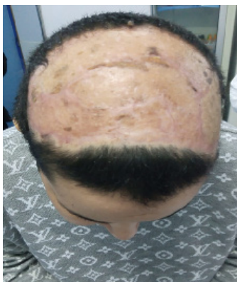
Figure 5. Grafting of the donor zone.