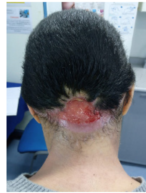
Figure 6. Dehiscence of the posterior scalp flap area.