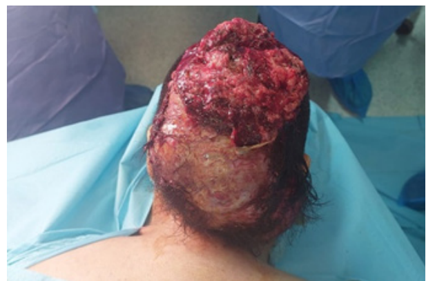
Figure 1. Preoperative tumor lesion (posterior view).

The evolution was marked by the appearance of a drop in visual acuity with oculomotor disorders; intracranial hypertension was suspected and then confirmed by a fundus examination, which showed macular edema. The patient was then put on a carbonic anhydrase inhibitor with a good evolution and total recovery of visual acuity and eyeball motricity. At the operative site, the posterior sutures were loosened, exposing part of the cranioplasty cementum. Antibiotic coverage and directed healing with pro-inflammatory dressings enabled closure of the dehiscence (Figure 6). An anatomopathological study confirmed the diagnosis of round-cell sarcoma infiltrating the outer table of the occipital bone, with healthy excision margins. The patient's case was discussed again at a multidisciplinary consultation meeting, and given the size of the tumor and its recurrent nature, adjuvant radio-chemotherapy was initiated with a good outcome.